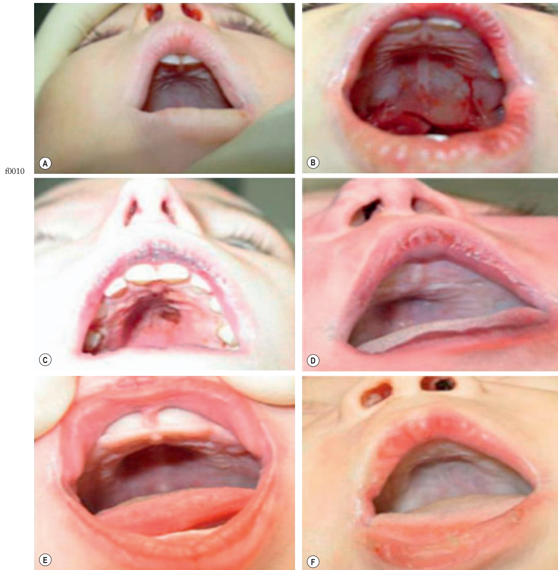
FIGURE 34-1 Montage of abnormal high and narrow hard palate in Cases 1–6. Note that all children present a visually recognizable abnormal high and narrow hard palate which is related to the development of the naso-maxillary complex during embryonic development considering age of children. On the first row on the left, on the second row in both cases, and on the third row from the top on the right, note the abnormal noses presented by the patients. The asymmetry of the nostril may not be obvious at first investigation; using photographs taken below the nose may help performing better analyses. Asymmetrical opening is often associated with asymmetrical septum and change in nasal resistance. When associated with high palatal vault, they indicate presence of a higher upper airway resistance and greater risk of abnormal breathing during sleep with addition of infectious or inflammatory reaction. From Rambaud C, Guilleminault C, Death, nasomaxillary complex, and sleep in young children. Eur J Pediatr. 2012 Sep;171(9):1349–58, with permission of Springer-Verlag 2012.

p0085 Until the recognition of BBO as a non-surgical option for improving posterior airway volume in actively growing children, 24 rapid maxillary expansion (RME) was considered the primary non-surgical orthodontic treatment of choice for treating OSA in children. 25