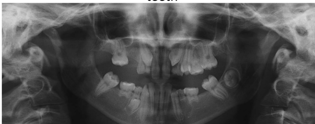
Fig. 3. Agensis of teeth related to gene mutation in a child that developed SDB. This simple dental X-rays show the many absent teeth related to mutation. The child has an apnea–hypopnea-index (AHI) of 3.8 with a much higher AHI in rapid-eye-movement-REM-sleep. Flow limitation defined with nasal cannula – pressure transducer, leading to important daytime fatigue and large and abnormal amount of cyclic-alternating pattern with abnormal amount of phase A2 and A3 during non-rapid-eye-movement – NREM-sleep indicative of sleep-disruption, is present during 71% of total sleep time. SDB: sleep-disordered breathing.

Missing 6 upper teeth, missing 5 lower teeth