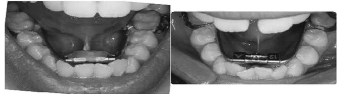
Fig. 4. Frenulum. Example of a short frenulum in a child that presented with speech difficulties early in life and developed sleep-disordered breathing (SDB) associated with a narrow hard palate. The abnormally short structure limits normal movements of the tongue and keeps it in an abnormally low set position when at rest. While the child had orthodontic treatment for his abnormal maxillary growth, the presence of his short frenulum was not recognized. It impaired successful results of orthodontia due to its continued restriction of tongue movements as indicated by persistence of high AHI (apnea–hypopnea index) at PSG (polysomnogram).