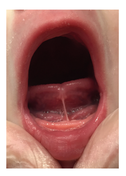
FIGURE 1: Lingual frenum with degree II ankyloglossia.

The time of the breastfeeds was measured by the mother herself, and to this end, the following time intervals were established: <15 minutes, 15–30 minutes, 30–60 minutes, and >60 minutes; the value chosen for the study and evaluating the evolution was the highest time interval.