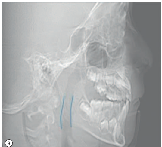
FIGURE 34-2 Note differences in cervical spine erectness and posterior airway area in pre-BBO Tx image (left) vs. post-BBO Tx image (right).

currently being trained to diagnose, treat and evaluate orthodontic treatment progress and final outcomes in accordance with cephalometric norms that are anthropologically uniformed, especially with regard to the baseline assessment of maxillary position relative to the anterior cranial base; this is potentially dangerous as this error can sometimes lead to diagnostic and treatment failures which in turn can have negative overall health implications related to inadequate posterior airway volume; e.g., cervical-pull headgear treatment and incisor retraction exacerbating compromised posterior airway volume in class II retrognathic patients. 30,31 Cooperative efforts between anthropologists, dentists and other concerned health care professionals should be undertaken to revise currently used cephalometric standards so as to better reflect the true forward growth potential of the human dentofacial complex.