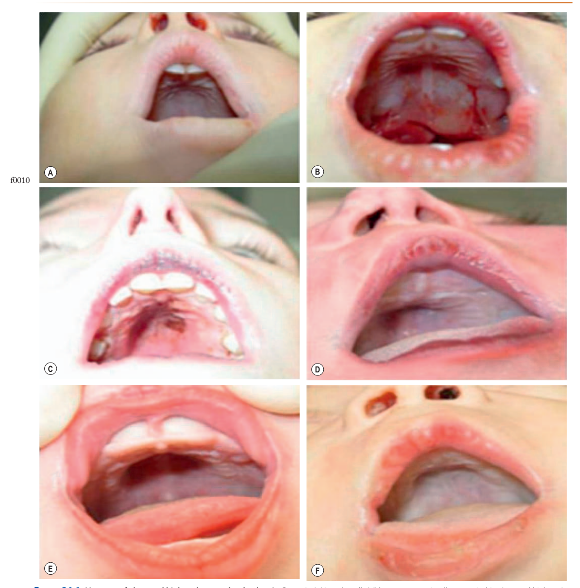
FIGURE 34-1 Montage of abnormal high and narrow hard palate in Cases 1-6. Note that all children present a visually recognizable abnormal high and narrow hard palate which is related to the development of the naso-maxillary complex during embryonic development considering age of children. On the first row on the left, on the second row in both cases, and on the third row from the top on the right, note the abnormal noses presented by the patients. The asymmetry of the nostril may not be obvious at first investigation; using photographs taken below the nose may help performing better analyses. Asymmetrical opening is often associated with asymmetrical septum and change in nasal resistance. When associated with high palatal vault, they indicate presence of a higher upper airway resistance and greater risk of abnormal breathing during sleep with addition of infectious or inflammatory reaction. From Rambaud C, Guilleminault C., Death, nasomaxillary complex, and sleep in young children. Eur J Pediatr. 2012 Sep;171(9):1349–58, with permission of Springer-Verlag 2012.

Until the recognition of BBO as a non-surgical option for improving posterior airway volume in actively growing children, <sup>24</sup> rapid maxillary expansion (RME) was considered the primary non-surgical orthodontic treatment of choice for treating OSA in children.25