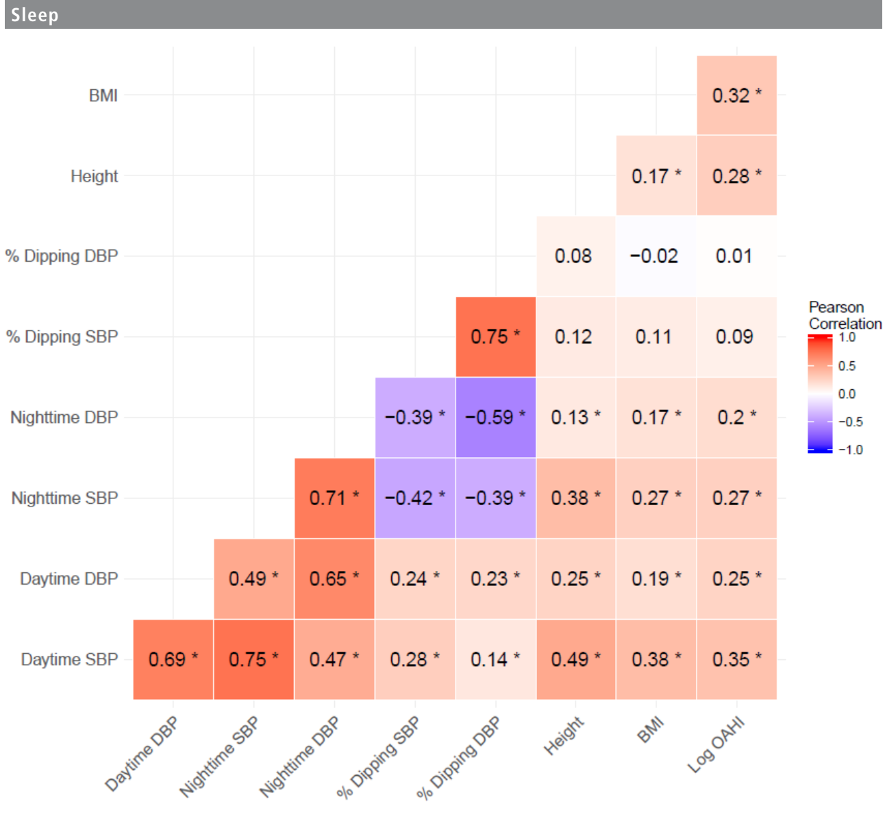
Figure 2 Heat map showing correlations of SBP and DBP (daytime, night-time and dipping) at follow-up with height, BMI and log-transformed OAHI at follow-up. *P<0.05. BMI, body mass index; DBP, diastolic blood pressure; OAHI, obstructive apnoea–hypopnea index; SBP, systolic blood pressure.

association however, was not demonstrated in nocturnal diastolic hypertension or non-dipping of DBP (table 4). Moreover, moderate-to-severe OSA at baseline was significantly associated with higher nocturnal SBP and reduced SBP dipping regardless of OSA status at follow-up after adjusting for sex, age, BMI and height at baseline, height at follow-up and parental hypertension (table 5). There was a trend that individuals with both childhood moderate-to-severe OSA and adult OSA had higher SBP at follow-up than those who had only childhood disease (table 5).